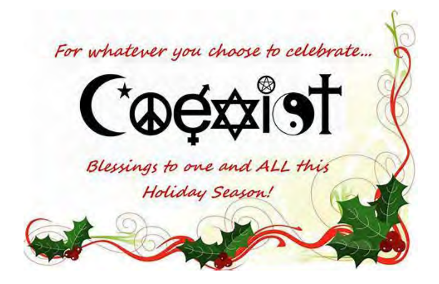
Since there is no January meeting, the next issue of The Branch will not be published until February. See you in 2023!